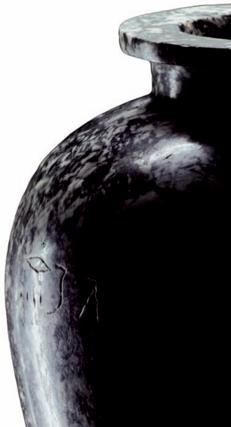
Fig. 5 Measure capacity signs on stone vessel MSH09G-i0967 from Tomb VII

The three capacity signs are located on the shoulder of the vessel, with the writing at a 90° angle to the inscription (Figs. 5, 6). The signs each indicate a volume capacity, each representing unit fractions. The signs are written from right to left, from the largest to the smallest volume. There is no doubt that the signs originated with the pro-