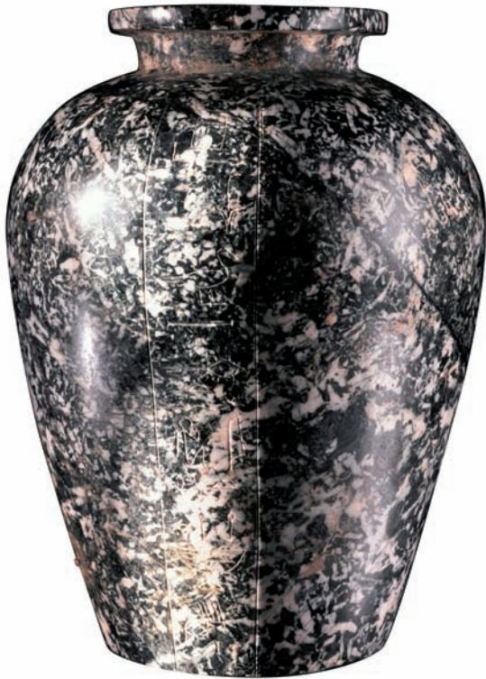
Fig. 2 Stone vessel MSH09G-i0967 from Tomb VII