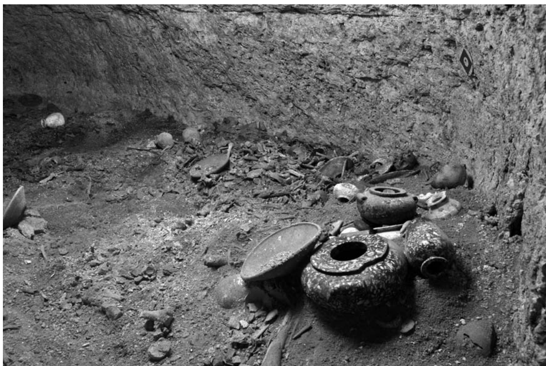
Fig. 1 Findspot of stone vessel MSH09G-i0967 within Tomb VII (lower right) among pottery vessels and other Middle Bronze Age and Early Dynastic stone vessels

In addition to a large number of imported Egyptian and locally produced Egyptianizing stone vessels, one Egyptian stone vessel bearing a hiero-